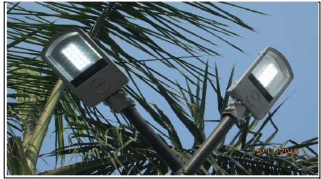
Description: Lights in periphery area