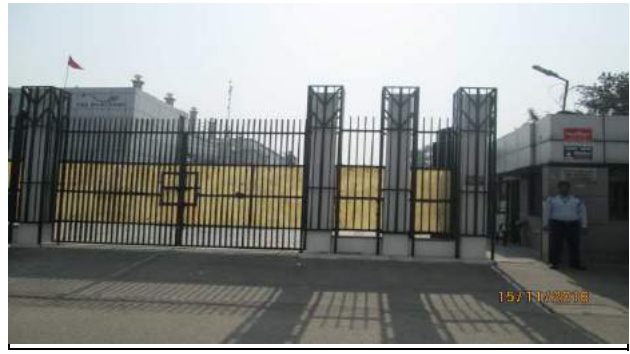
Description: Facility main gate with security guard