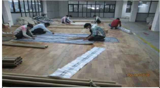
Description: Clipping section