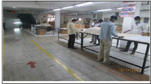
Description: Checking section