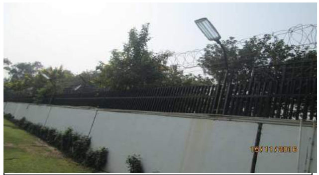
Description: Periphery wall