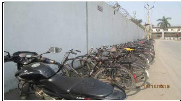
Description: Employees parking area