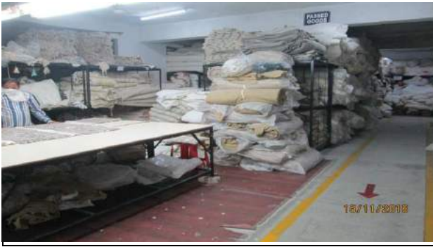
Description: Semi finished good Section