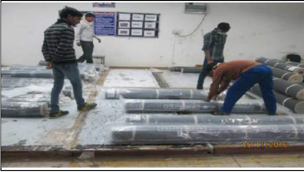
Description: Packing process