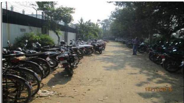
Description: Employees parking area