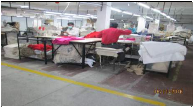
Description: Stitching section