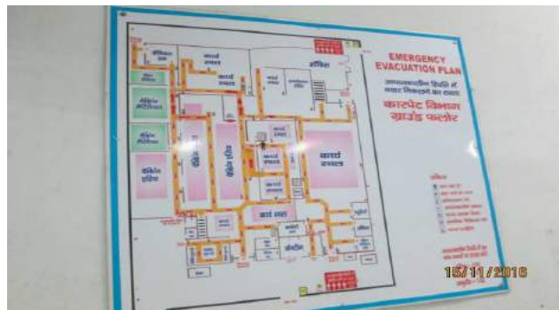
Description: Evacuation plan