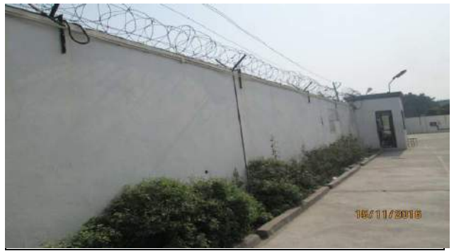
Description: Periphery wall