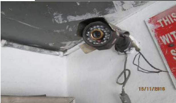
Description: CCTV on gate