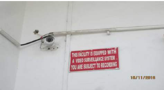
Description: CCTV at loading area