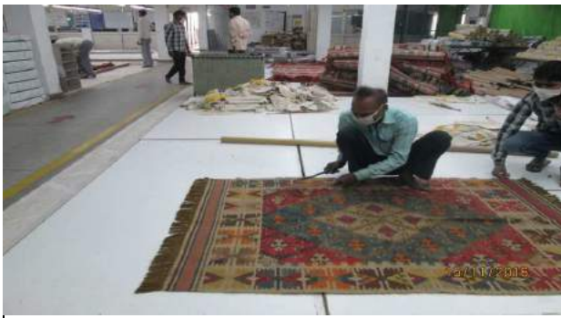
Description: Finishing section