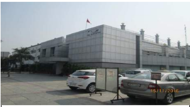
Description: Facility Building