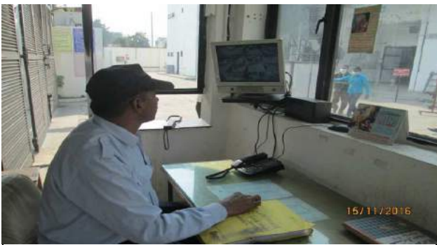
Description: Security supervisor on gate