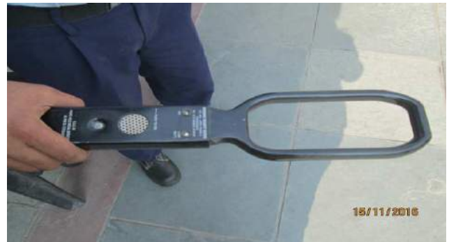
Description: Metal detector