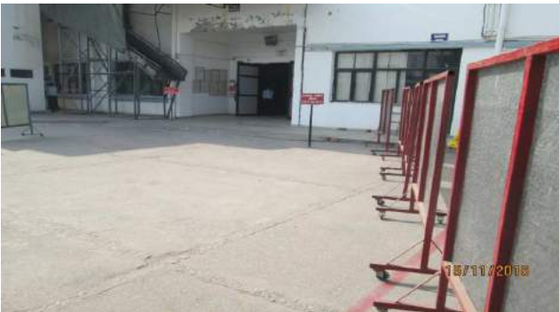
Description: Loading section