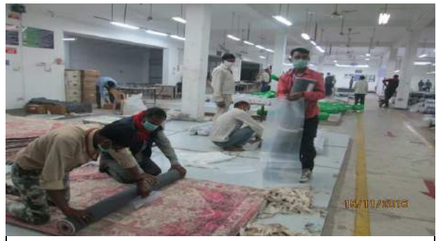
Description: Packing section