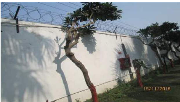
Description: Periphery wall