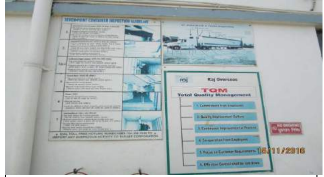
Description: 7 point inspection checklist for employe reference