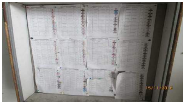
Description: Authorised person list at packing section