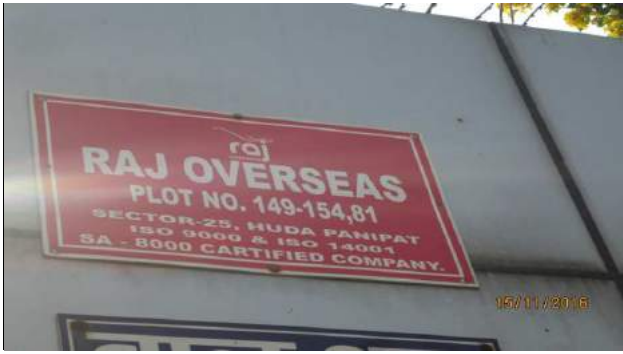
Description: Facility Name Board