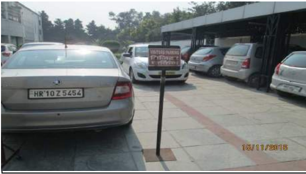
Description: Visitor parking area