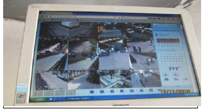
Description: CCTV monitoring