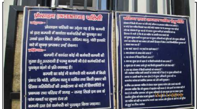
Description: Security Policies displayed