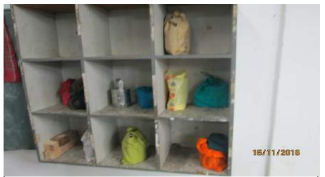
Description: Lunch box storage area