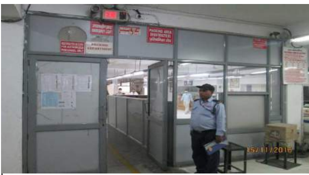
Description: Packing section with guard